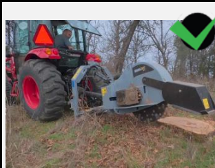
Shoot From A Variety Of Angles & Zoom Positions