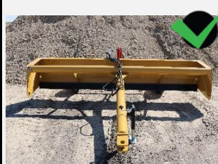
Take Photos Alone & Hooked Up To The Vehicle