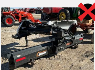
Take Pictures In Open Areas Without Background Objects